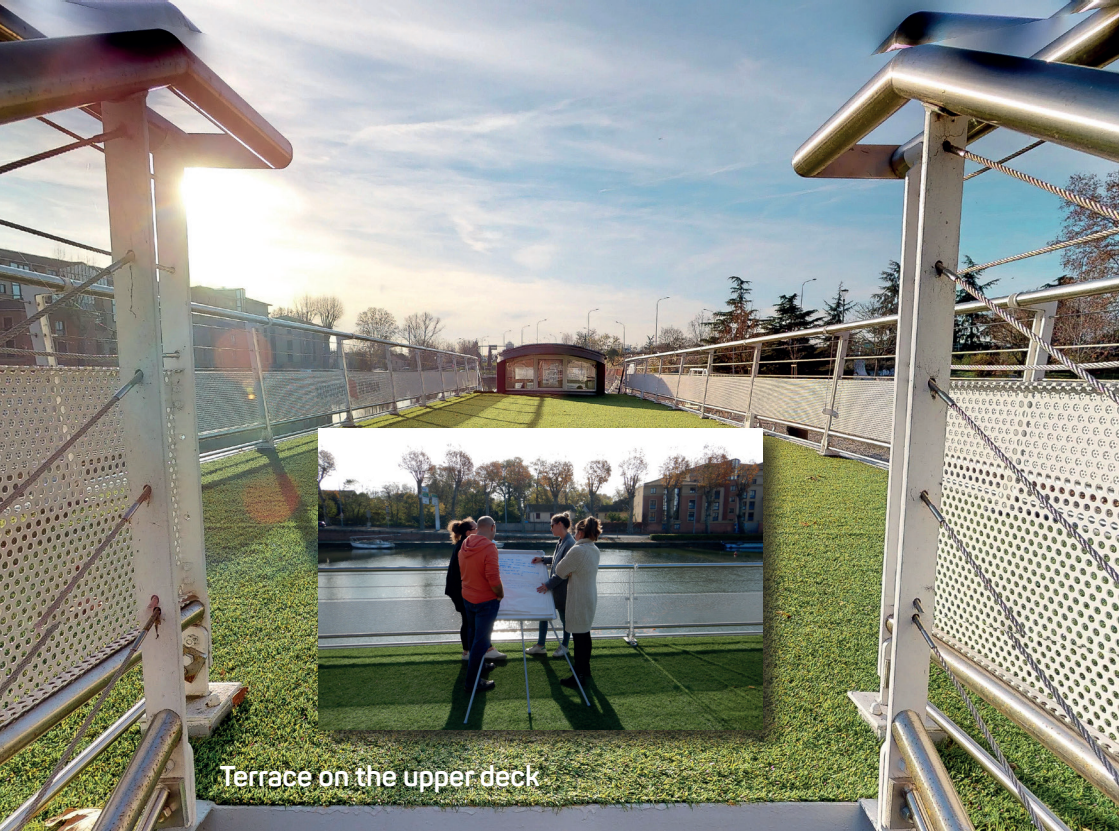
Terrace on the upper deck